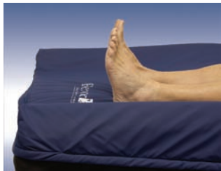
Specially designed sloped heel area for added protection

• The pivoting controller can be placed on either side of the bed and will not interfere with bed controls or accessories